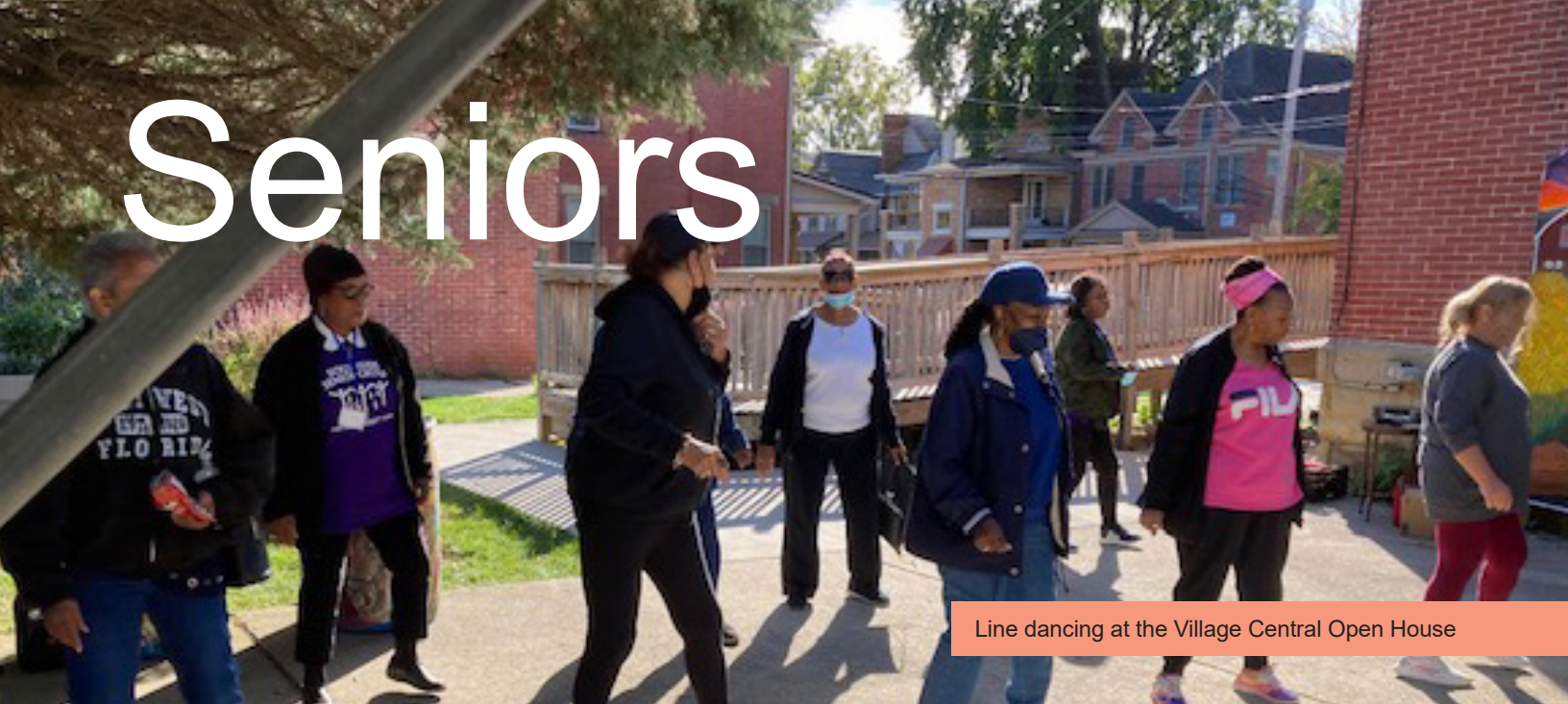
Line dancing at the Village Central Open House