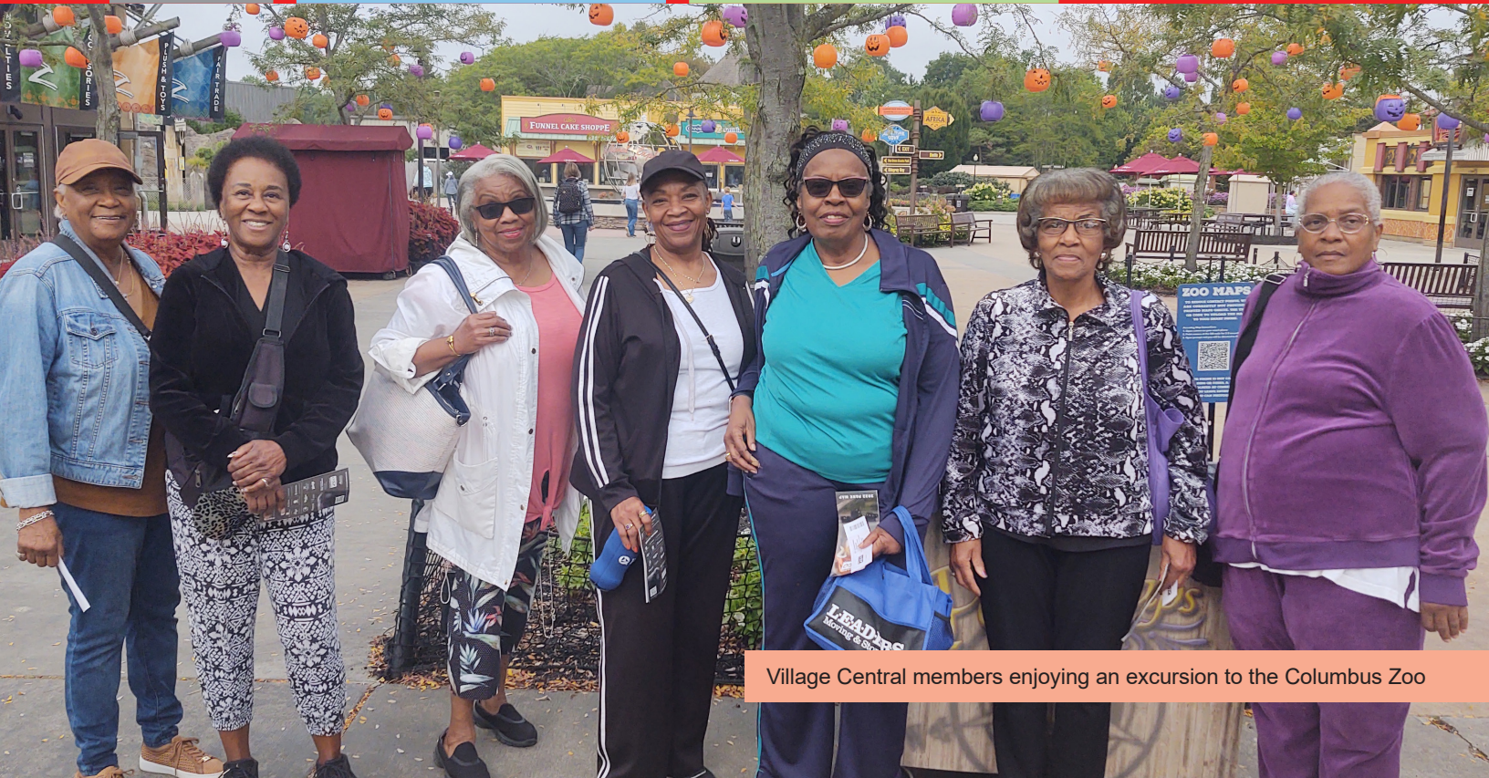
Village Central members enjoying an excursion to the Columbus Zoo