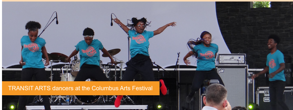
TRANSIT ARTS dancers at the Columbus Arts Festival

90% improved or maintained their self-esteem.